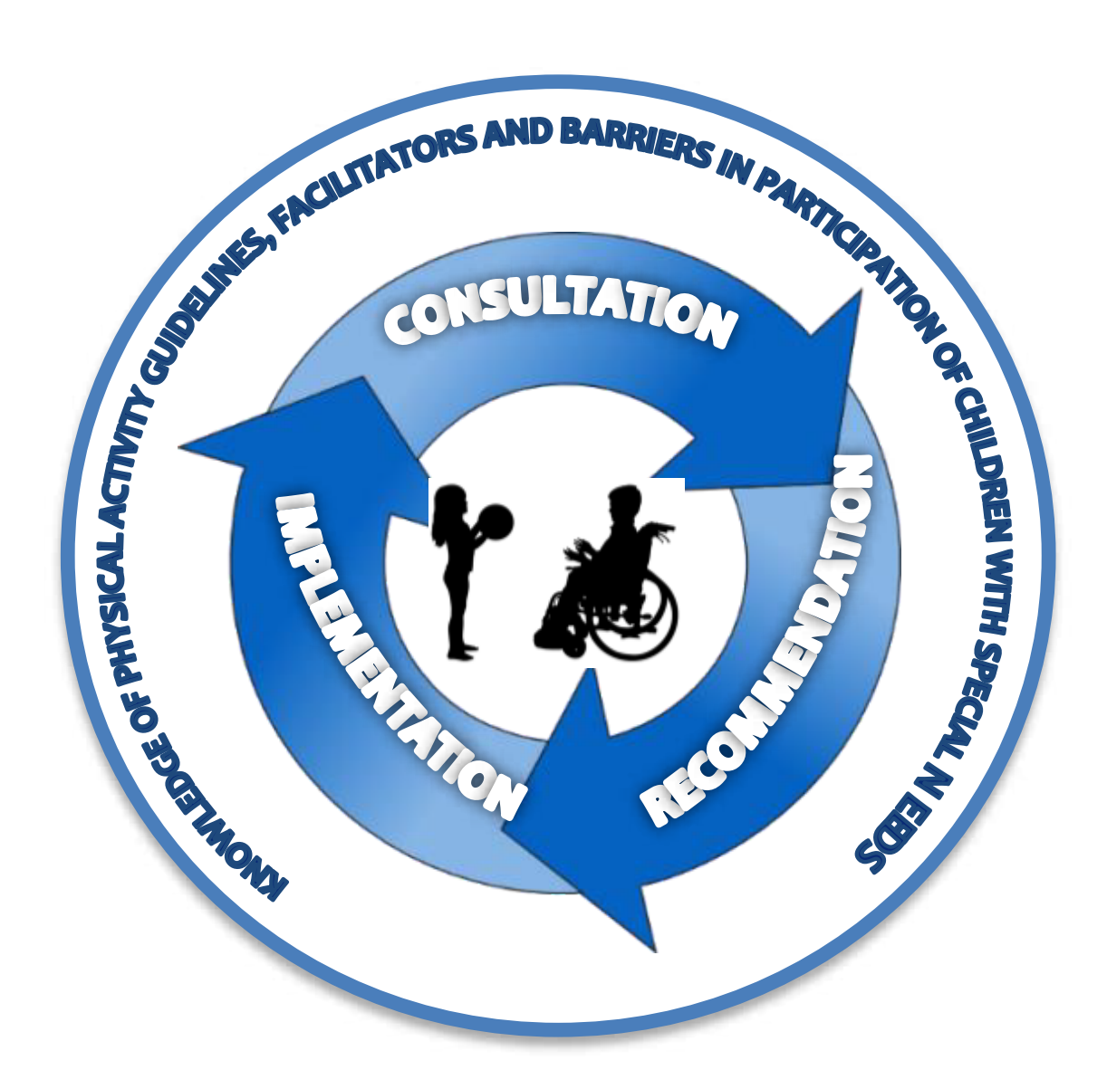
Figure 1: Guidelines for consulting with children and adolescents living with disability