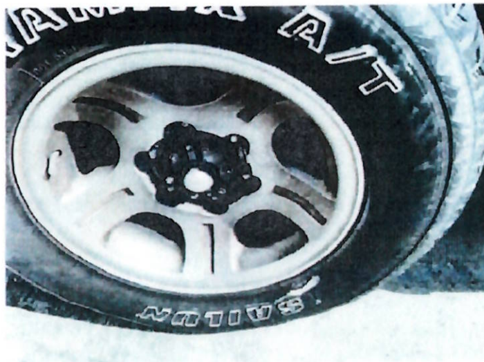
Tyre manufacturer on 2016